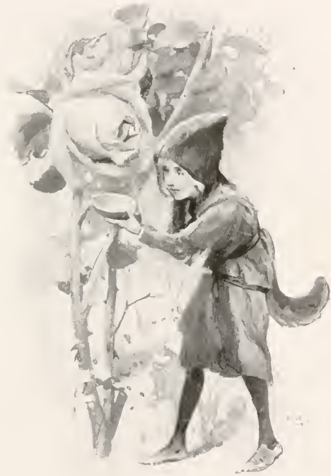
Jacob had to draw the dew from the roses (P. 118.)

Several years had now passed away in the